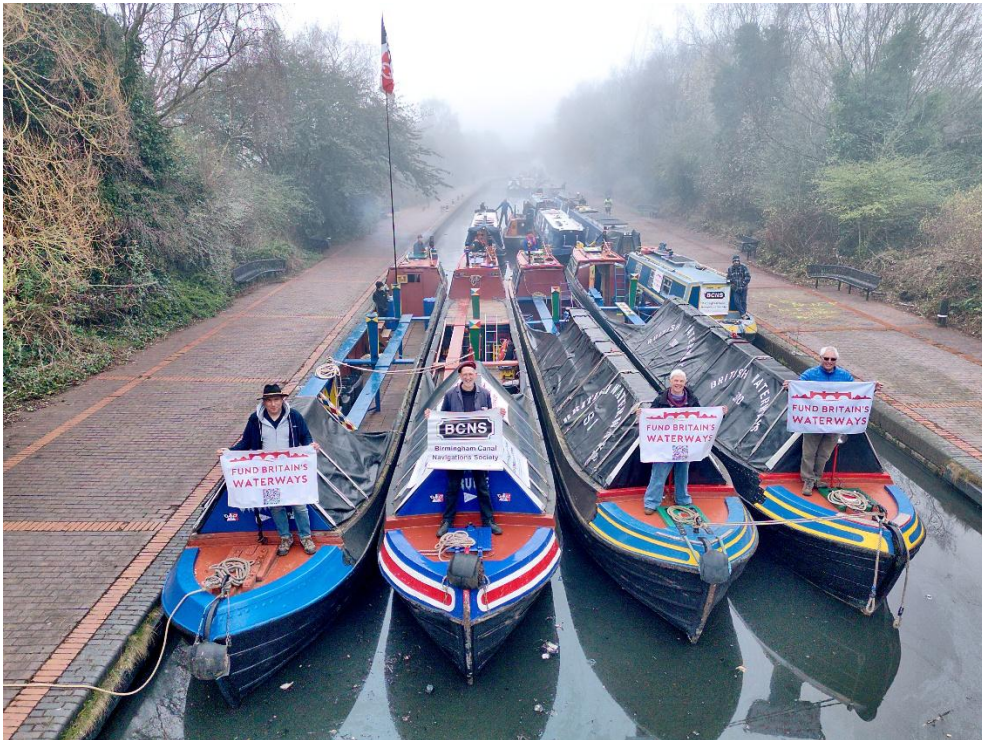
1. Flotilla gathered at Moorcroft Junction, Walsall Canal on the morning of Saturday 21 March, with BCNS and FBW banners