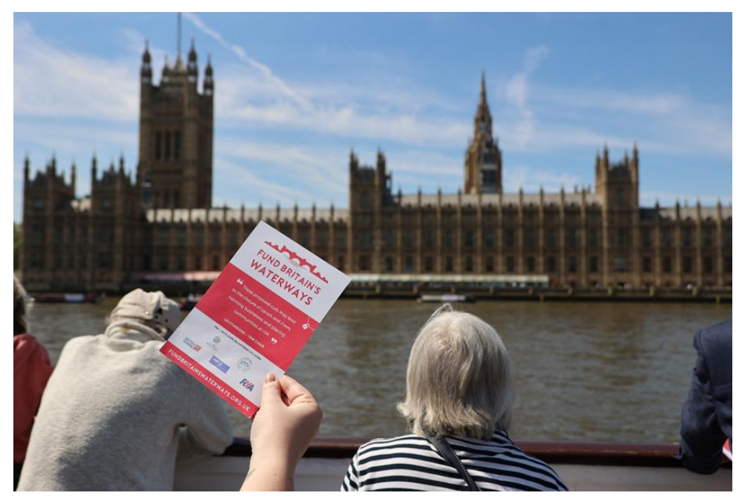
FBW campaigners on the VIP boat off the Palace of Westminster, 8 May 2024