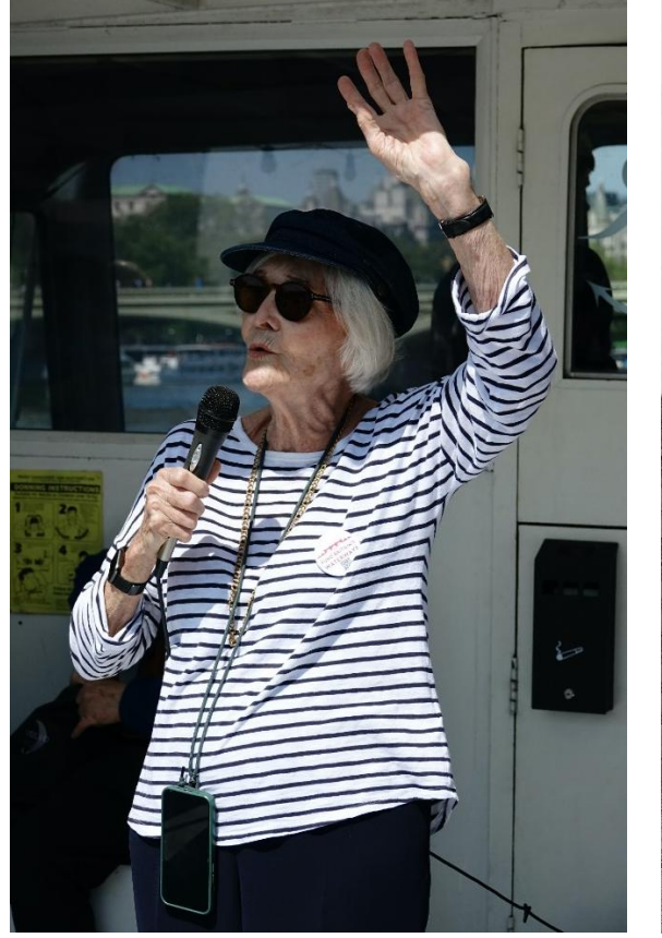
Dame Sheila Hancock DBE speaking on the VIP boat off the Palace of Westminster, 8 May 2024