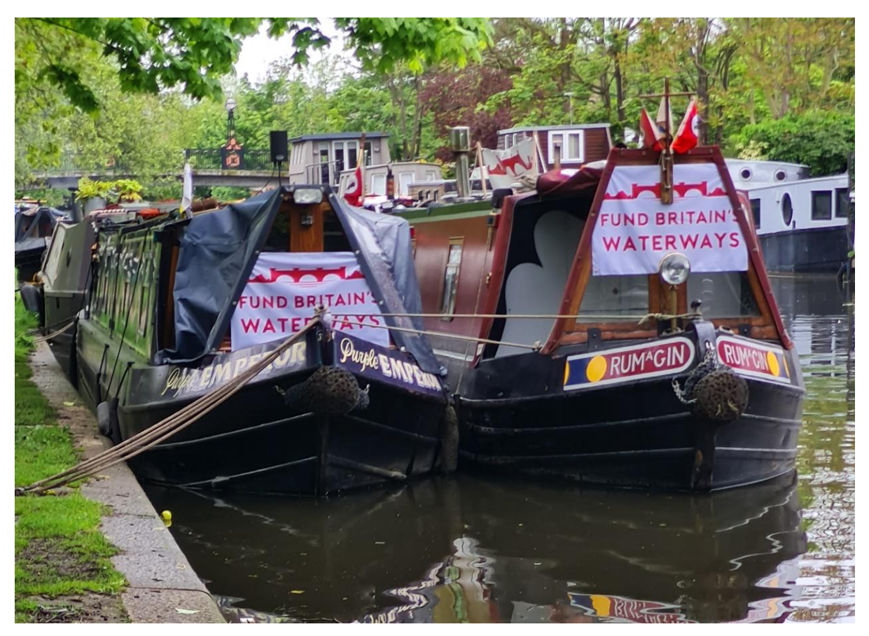
FBW participants at IWA Canalway Cavalcade 2024 in Little Venice