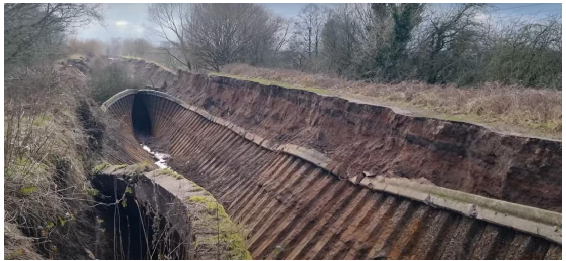
Bridgewater Canal breach

The images of the New Year's Day embankment collapses on the Bridgewater and Huddersfield Narrow Canals are stark reminders of the threats to our inland waterways.