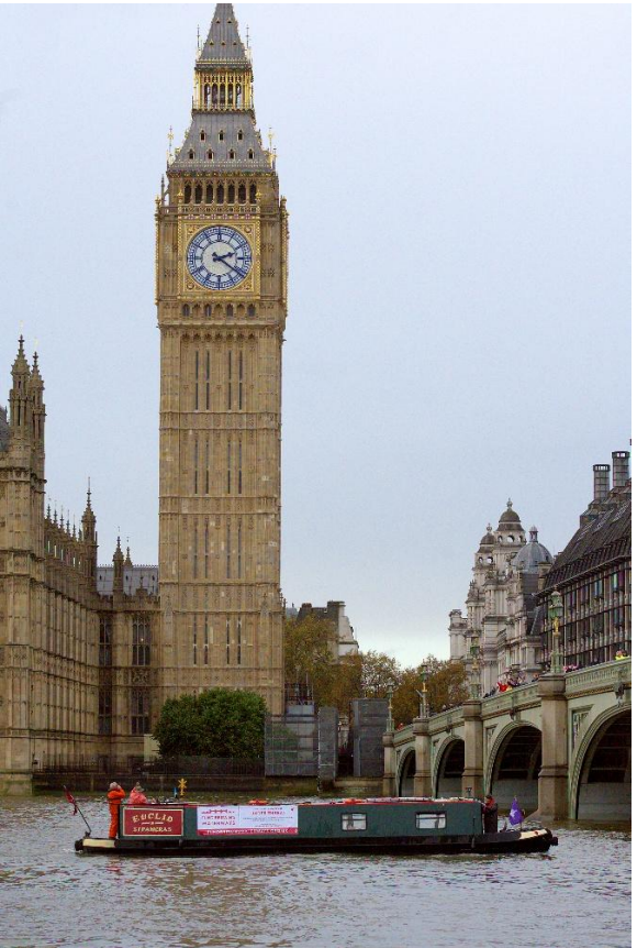
nb Euclid passing Big Ben on the 14 November 2023 campaign cruise