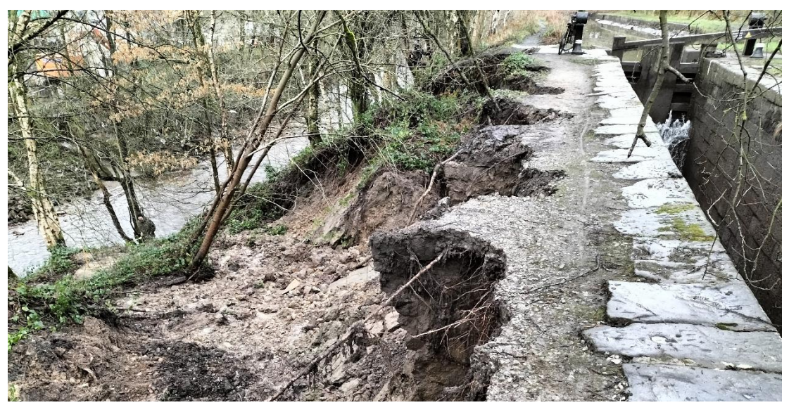
Embankment collapse at Lock 11 West, Huddersfield Narrow Canal