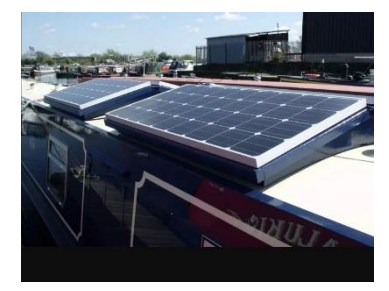
Rigid Solar Panels on a Narrowboat

The usefulness of such power depends on the usage, battery capacity and other charging options. What amounts to a useful contribution to a three-battery domestic installation on a diesel-engined boat will barely be significant on an electric-drive one with a generator and up to 20 times the battery capacity.