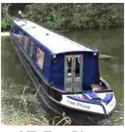
NB Free Phase