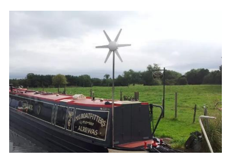
A Wind Turbine on a Narrowboat

generate about 10 kWh/day in mid-Summer, though 6-9 kWh is more likely in practice. This should be enough for domestic use and limited daily cruising for a few weeks. However, as solar insolation falls by about 1/3rd (compound) for every month before or after mid-Summer's Day, even at the beginning of May or end of August less than half that power will be available, requiring a choice between eating and cruising. With less than 1 kWh/day at Christmas there won't be enough to cook the turkey!