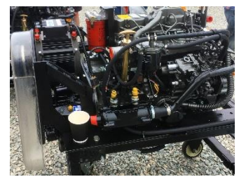
A Typical Parallel Hybrid Configuration

By 'electric-drive' is meant a boat in which the only means of propulsion is an electric motor powered from batteries charged by a generator, solar panels and/or a shoreline. Such a system is often referred to as a 'Serial Hybrid', though this isn't really correct as it lacks the either/or option which is a feature of hybrids. 'Parallel Hybrids', which are true hybrids, are less efficient than 'Electric Drives' because they completely miss out on factor C below and largely miss out on factor A. How much they benefit from factor B depends on how they are used.