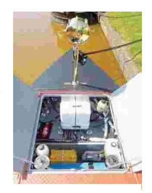
A Typical Generator Installation

If space restricts you to a smaller battery bank than suggested, you may want your generator to start automatically so that your cruising isn't curtailed. If so, it is best to opt for keel cooling and a dry exhaust as running a water-injected one while cruising increases the risk of blockages. Otherwise, raw water cooling has a lot to commend it as not only is it cheaper but it permits the use of rubber hoses, thereby avoiding the embrittlement problems of metal exhausts.