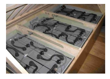
A Lead-Acid Traction Cell Installation

The battery capacity needed depends on how fast and for how many hours per day a boat will cruise. 1.5 kWh per cruising hour will probably be slightly generous for typical, 1 lock/mile, canals, so a boat cruising for 6 hours/day is likely to use up to 9 kWh/day. Gentle use and/or shorter days will reduce this, though it is probably wise to provide for more demanding use than is actually envisaged. As the power required increases rapidly with speed (4 mph needs 2½ times as much power as 3 mph, for example), anyone wishing to cruise faster on a regular basis (on a river, for example) may want to install more capacity to avoid the need to charge more frequently, though space is likely to be a limiting factor .