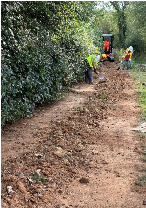
Compacting the backfilled trench to restore the towpath.

After the trench had been dug the ducting was placed in sections with connectors. Then some infill was placed, followed by warning tape, followed by more backfill that was compacted before the final backfill was placed and compacted again by the wacker plate to restore the towpath.