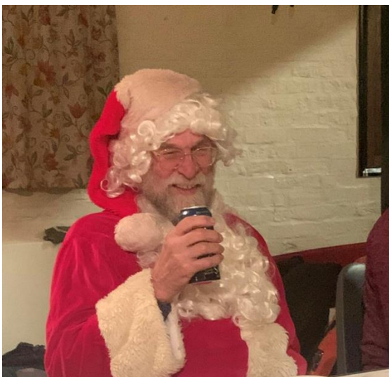
Santa enjoying a well-earned beer.