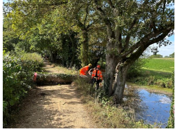
Forestry removed dead ash trees below the lock.

Forestry were doing forestry things and helping clear the towpath of ash trees that have been affected by ash die back meaning a number of trees are now in an unsafe condition so unfortunately need to be removed.