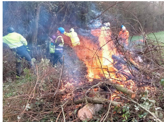
Martin and Pete started the fire.

When the boat arrived it was transformed into a bridge so we could unload the kit and allow everyone to access the off side to begin work. This was of the classic Christmas party variety and involved scrub bashing and bonfire building.