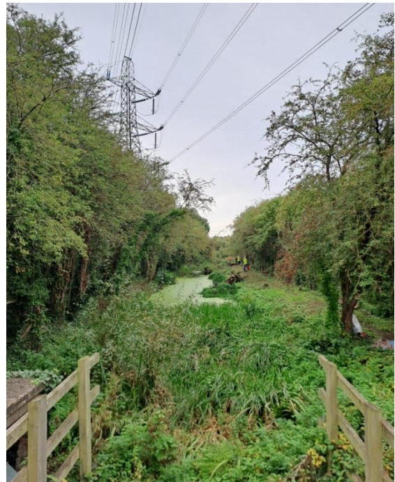
The electricity substation site on Saturday morning.

A lot of these trees that had been felled had already started sprouting new willow growth so they needed to be removed but they were very heavy and difficult to break up.