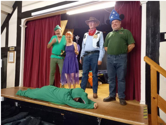
The dresser-uppers! Can you guess who they are? Note the theme is Disney and no-one is dressed as Robin Hood!

deployed as a boat to allow a canoeist to use the canal but we all agreed its great to see the restored canal being used for both walkers and water activities. An unusual aspect of part of the towpath here is that it is also used by horse-riders! We had a late lunch and packed up in time to clean the hall and disperse just as the daylight went. It was a productive and very enjoyable festive weekend.