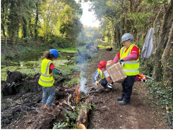
Starting more fires on Sunday.

The bridge team soon arrived back to help with using the tiffors and continuing the scrub clearance. We packed up for the long drive while it was still light having made a dent in the destruction of the willow roots.