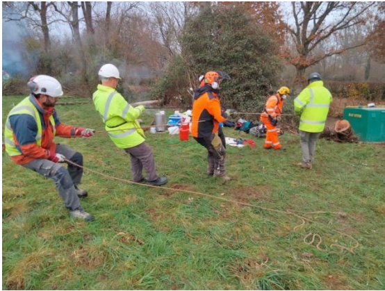
This is what to do when the piece of tree is too heavy for one person to lift.

trees are sprouting small spindly new growth which apparently means the tree itself is struggling – one had already fallen so this was removed by a team from a boat.