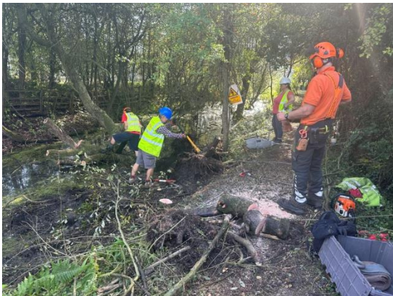
Using tiffors and hand tools to remove stumps.

In the morning we had some changes for breakfast and Martin D essentially made Welsh rarebit for the vegetarians which made a nice change. On site we had to get the three tiffors going to start the epic task of removing some enormous tree stumps from the canal bed. One particularly well-rooted stump took a new split pin and the entire day with teams working in relay to get out.