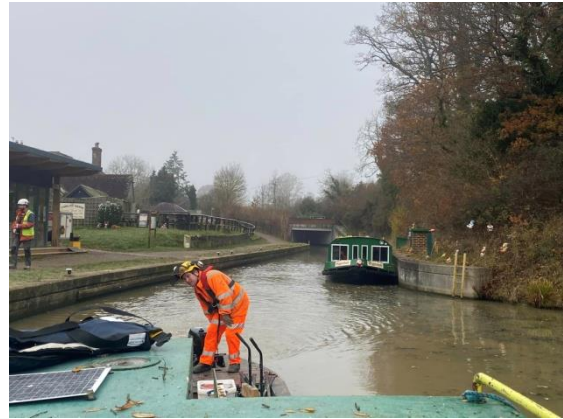
Pete is steering the workboat with all the kit down to site.

Pete steered the boat down with Adrian C to find the walking party. The walking party had set off purposefully without much idea of where they were headed but fortunately had chosen the right gap in the hedge to stand opposite to.