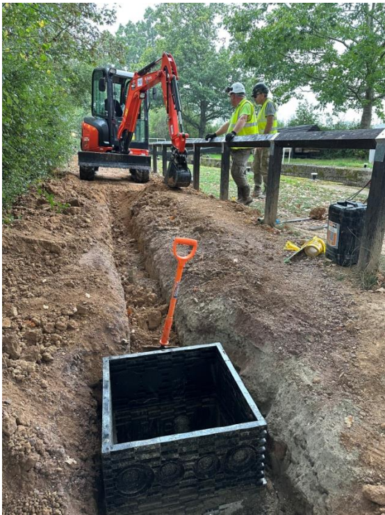
A manhole was also built.

Sunday was much of the same with the final job for the LWRG team to construct a manhole cover.