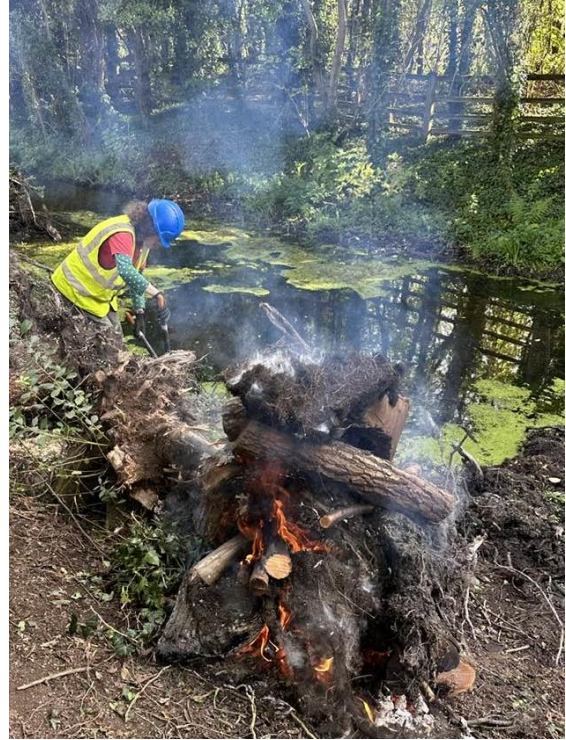
Stump fire.

A lot of these trees that had been felled had already started sprouting new willow growth so they needed to be removed but they were very heavy and difficult to break up.