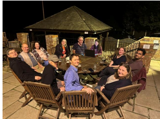
Saturday evening drinks at the Corbet Arms.

custard or yoghurt. We did part of the AGM before dinner and part after then as we had forgotten any other business we had to do that in the pub.