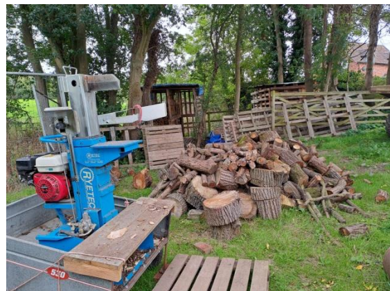
The log splitting site at the Northern portal of the Berwick Tunnel with a pile of logs to be reduced to stove-sized lumps before drying.

On Sunday Martin D had sourced some eggs and the vegetarians had omelette for breakfast- the meat eaters ate the same as usual.