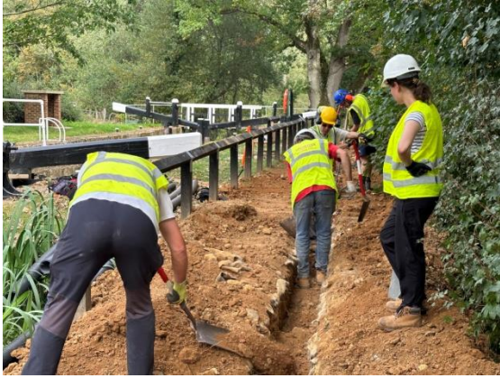
Backfilling the trench after the duct has been laid.

After the trench had been dug the ducting was placed in sections with connectors. Then some infill was placed, followed by warning tape, followed by more backfill that was compacted before the final backfill was placed and compacted again by the wacker plate to restore the towpath.