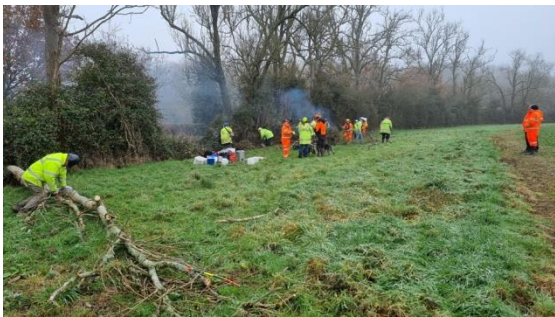
The work site is on the offside of the canal.