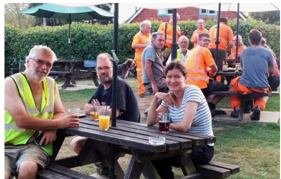
A pint before dinner at the Onslow Arms.