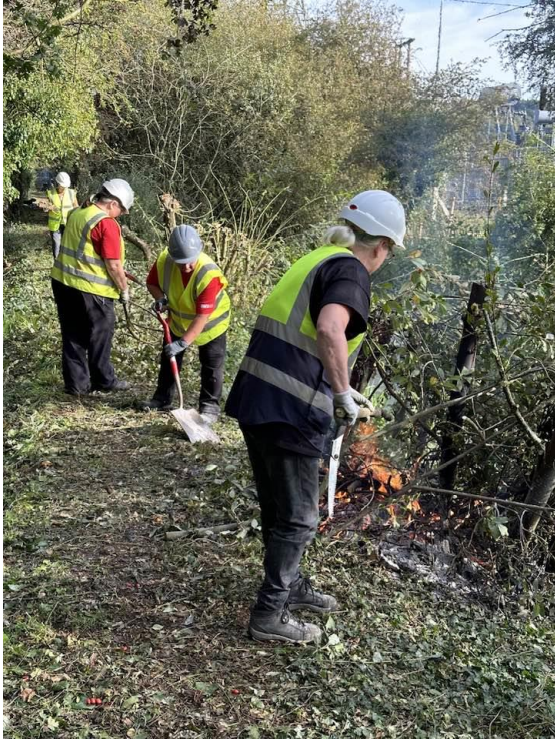
Tidying the towpath and trying to dispose of stumps.