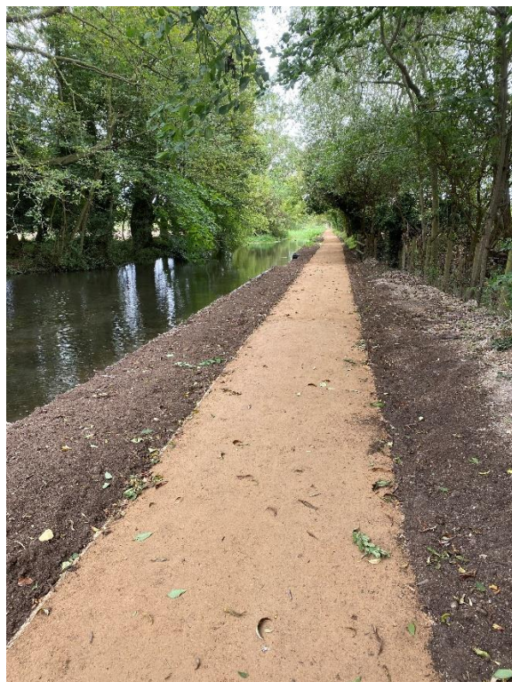
Wendover-Halton Parish border