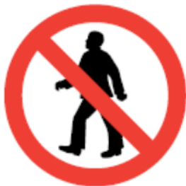
No access for pedestrians