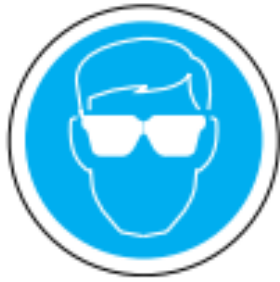
Eye protection must be worn

Mandatory signs: Round shape, white pictogram on a blue background.