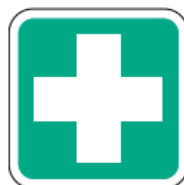
First aid poster