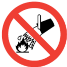
Do not extinguish with water