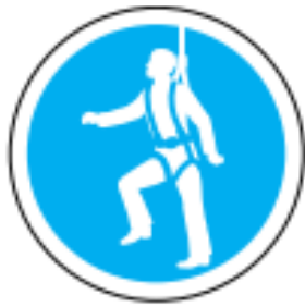
Safety harness must be worn