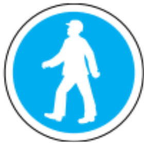
Pedestrians must use this route