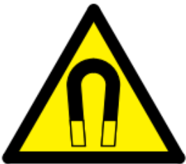
Strong magnetic field