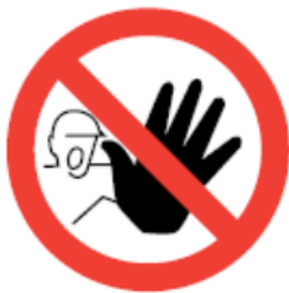
No access for unauthorized persons

Prohibition signs: Round shape, black pictogram on a white background, red edging and diagonal line.