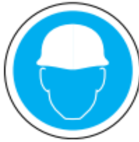
Safety helmet must be worn