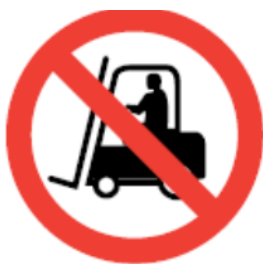
No access for industrial vehicles