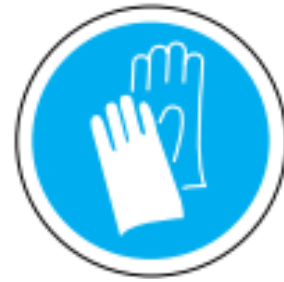
Safety gloves must be worn