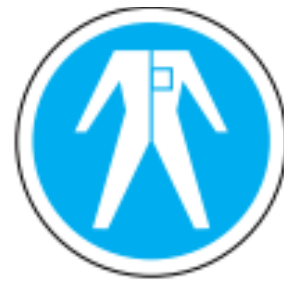
Safety overalls must be worn