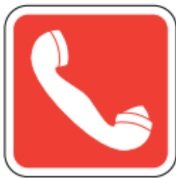
Emergency fire telephone