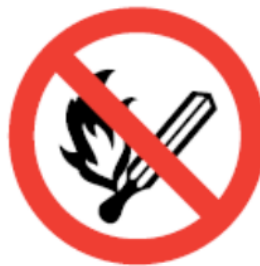
Smoking and naked flames forbidden