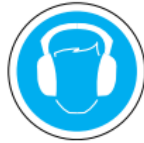
Ear protection must be worn