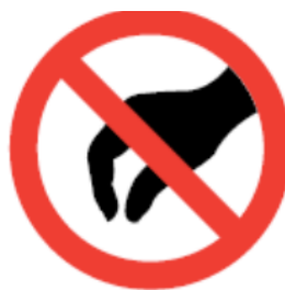
Do not touch