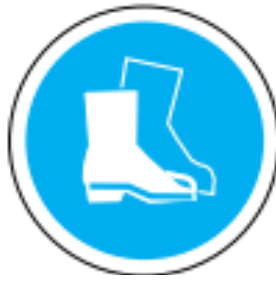
Safety boots must be worn