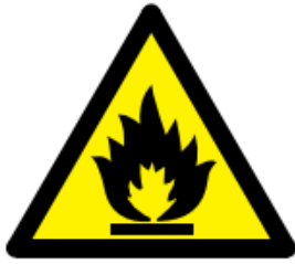
Flammable material or high temperature

Warning signs: Triangular shape, black pictogram on a yellow background with black edging.