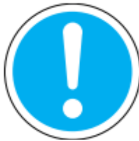
General mandatory sign (to be accompanied where necessary by another sign)