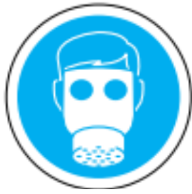
Respiratory equipment must be worn