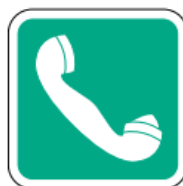
Emergency telephone for first aid or escape