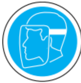
Face protection must be worn