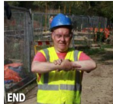
Hands clasped at chest height