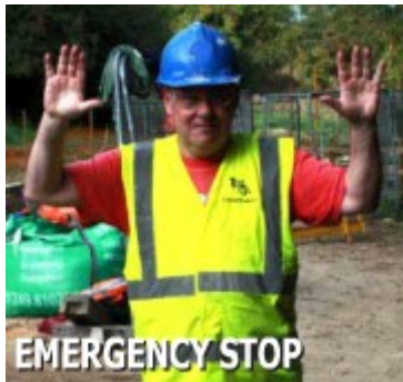
Palms facing forward