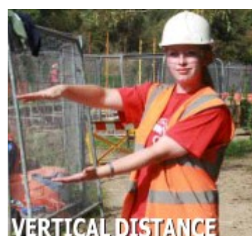
The hands indicate the relevant distance