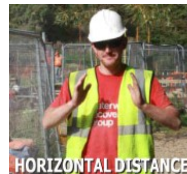
The hands indicate the relevant distance