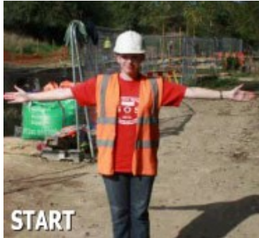
Palms facing towards machine operator

Here are some basic signals to be used when directing plant on site. The banksman should stand where he can be clearly seen by the plant operator and should be the only person directing the operation. Make sure the banksman knows what is being done.