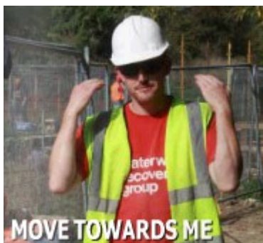
Forearms make slow movements towards body