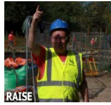
Forearm makes slow circular motion