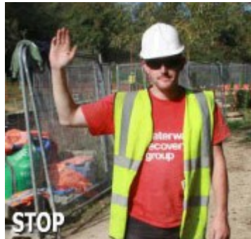
Palm facing towards machine operator