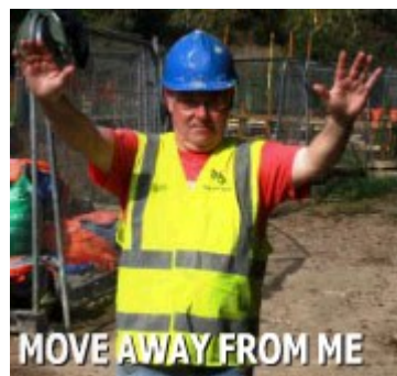
Forearms make slow movements away