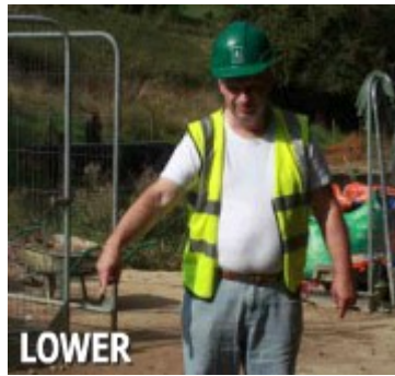
Forearm makes slow circular motion