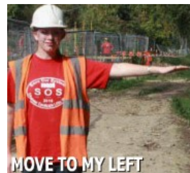
Make small horizontal movements with hand